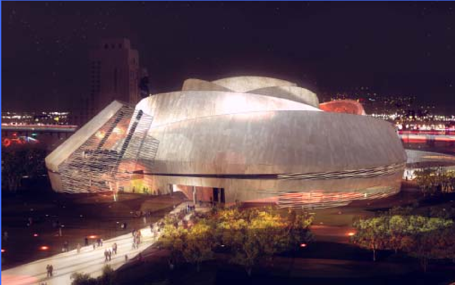
Massar, Discovery Center, Damascus - Henning Larsen Architects